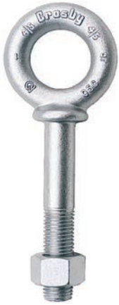
G-277 Shoulder Nut Eye Bolts