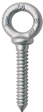
G-275 Screw Eye Bolts

*Ultimate Load is 5 times the Working Load Limit. Maximum Proof Load is 2 times the Working Load Limit.