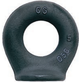
S-264 Pad Eye