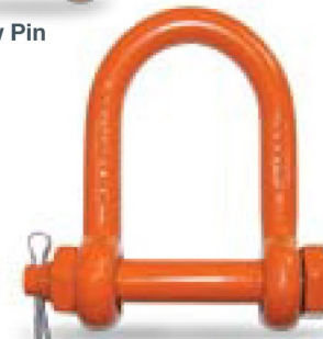
Bolt, Nut & Cotter