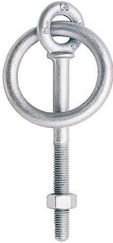
G-257 Shoulder Nut Ring Bolts