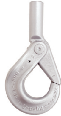
S-1318A SHANK HOOK