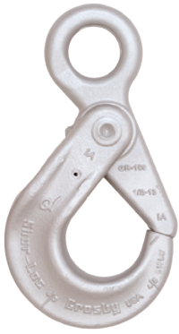
S-1316 EYE HOOK