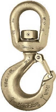
S-322CN / AN (L-322AN Shown)