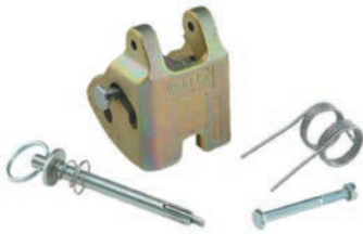
PL-N/O LATCH KITS