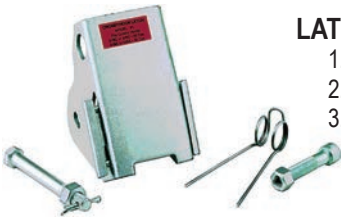
PL LATCH KITS