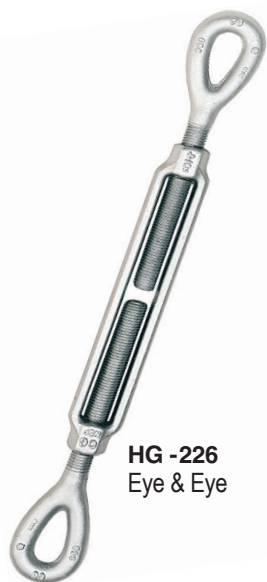
HG -226 Eye & Eye

Meets the performance requirements of Federal Specifications FF-T-791b, Type 1 Form 1 - CLASS 4, and ASTM F-1145, except for those provisions required of the contractor. For additional information, see page 452.