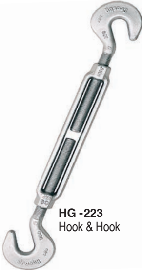
HG -223 Hook & Hook

Meets the performance requirements of Federal Specifications FF-T-791b, Type 1 Form 1 - CLASS 5, and ASTM F-1145, except for those provisions required of the contractor. For additional information, see page 452.