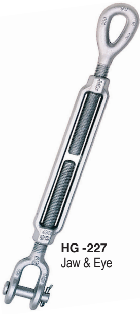
HG -227 Jaw & Eye